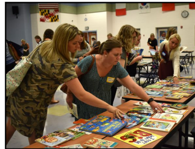
AARSPA members donated books to elementary and middle school beginning teachers.