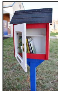
Park Elementary School