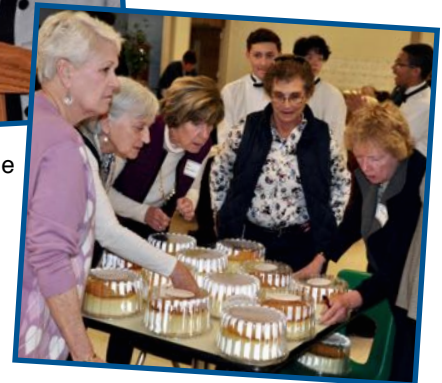
Pre-ordered cheese cakes distributed.