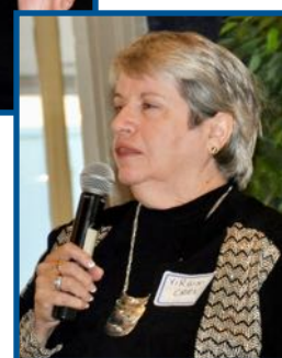
Legislative Committee Chair Virginia Crespo