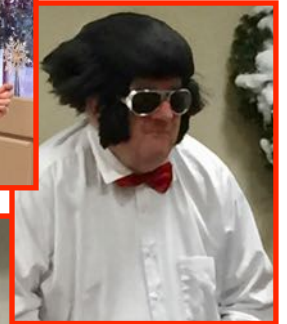
Elvis was in the house!