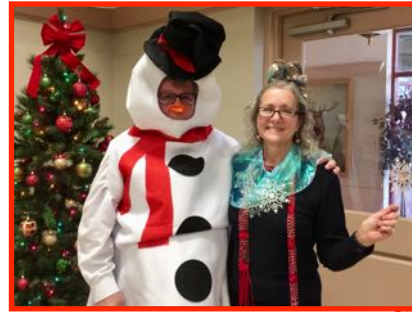
Frosty and Susie Snowflake

In addition to performing at a number of Senior Centers throughout the county, Voices in Melody also entertained members of the National Active and Retired Federal Employees (NARFE) at the Elks Lodge in Annapolis on December 20, where they received rave reviews!