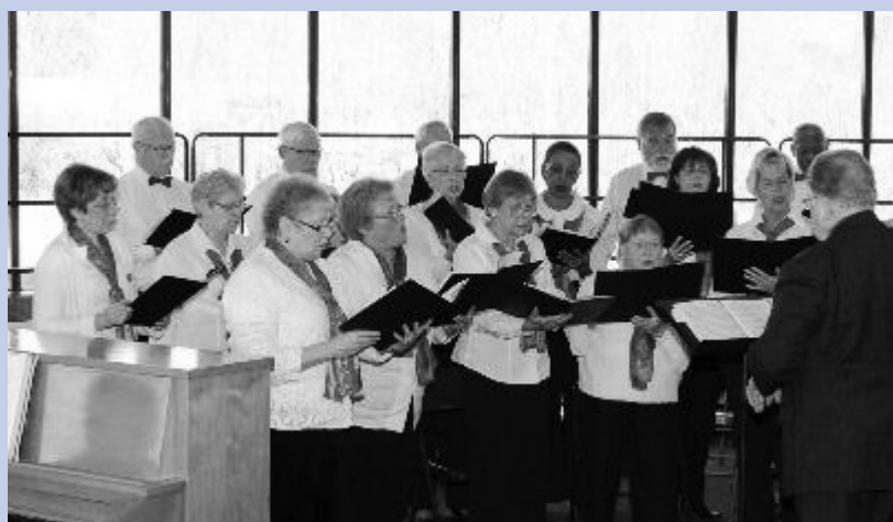
Our AARPSA Chorus, Voices in Melody, singing at the Board of Education on December 21, 2010.