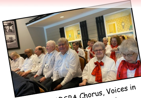
The AARSPA Chorus, Voices in Melody, performed.