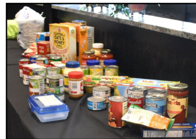
Canned food collected for the Anne Arundel County Food Bank.