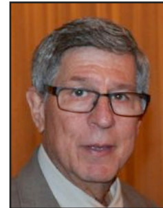
Melody , performed at Senior Centers and other locations.