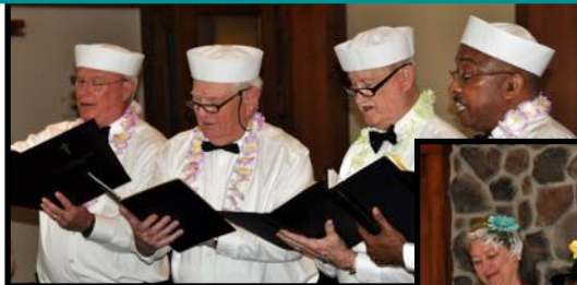
The Voices in Melody Chorus entertained with songs from South Pacific .