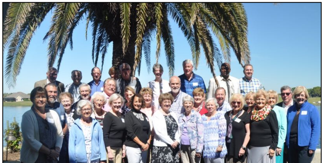
27th Annual Florida Get-Together